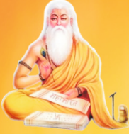
श्री वेद व्यास