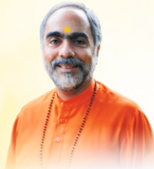
स्वामी स्वरूपानन्द सरस्वती