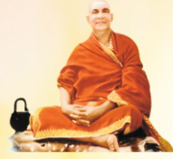
स्वामी शिवानन्द सरस्वती